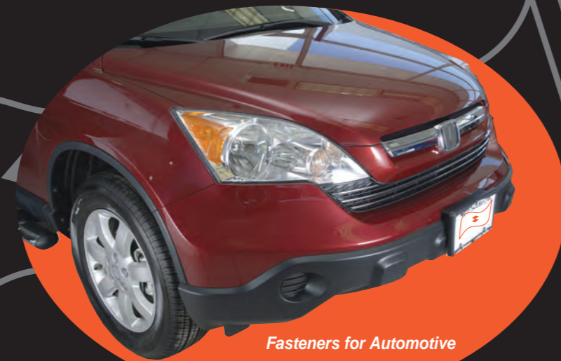
Fasteners for Automotive