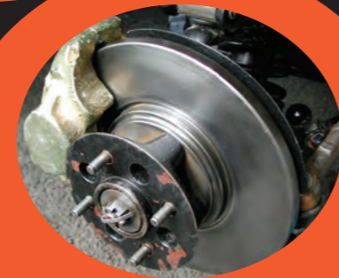
Fasteners for Automotive Components