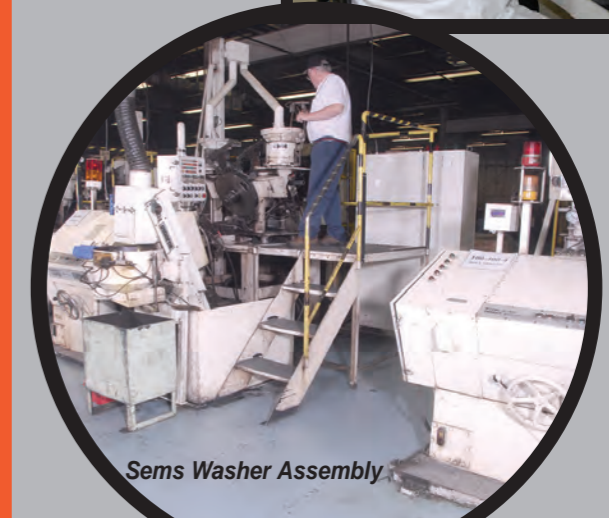
Sems Washer Assembly