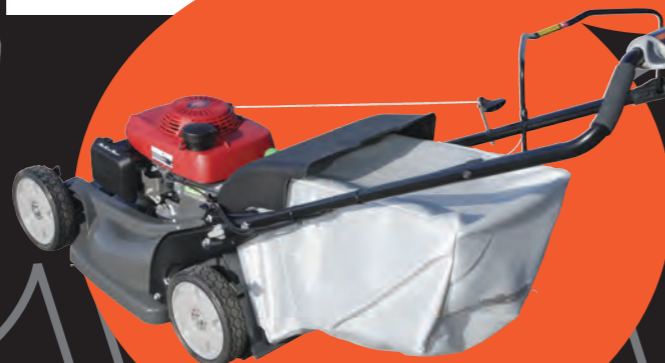
Fasteners for Lawn and Garden

Applying technical expertise and financial resources to customer problems enables Rocknel to realistically seek long-term, win-win customer relationships.