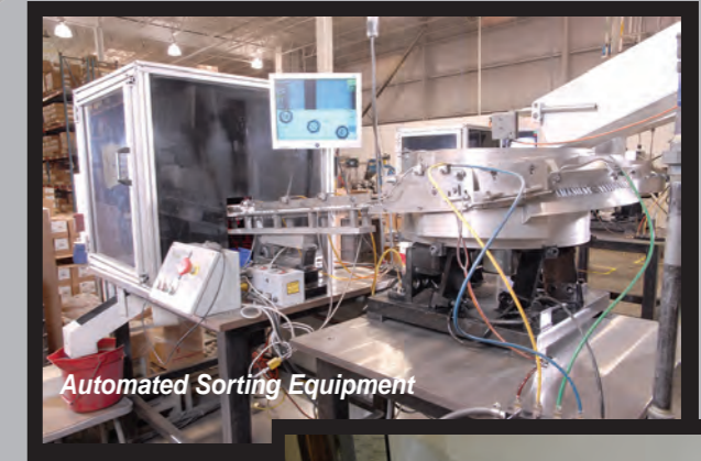
Automated Sorting Equipment